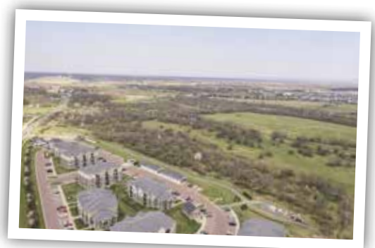
View of Target Property looking northeast from over the Valley Pike with newer development in the foreground

PS: Join us on September 25th for a tour of the McCann Farm as part of our 25th Anniversary celebration in Winchester!